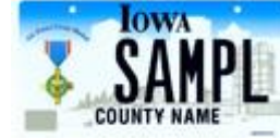
Air Force Cross Medal