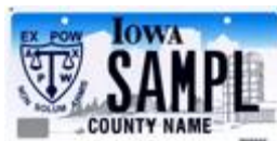
Ex-Prisoner of War