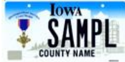
Service Cross Medal